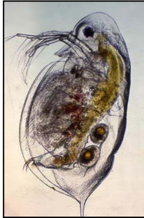
Figure 1. Image of a calcium-rich Daphnia .

Daphnia use calcium in the water to form their calcium-rich body coverings when they moult.